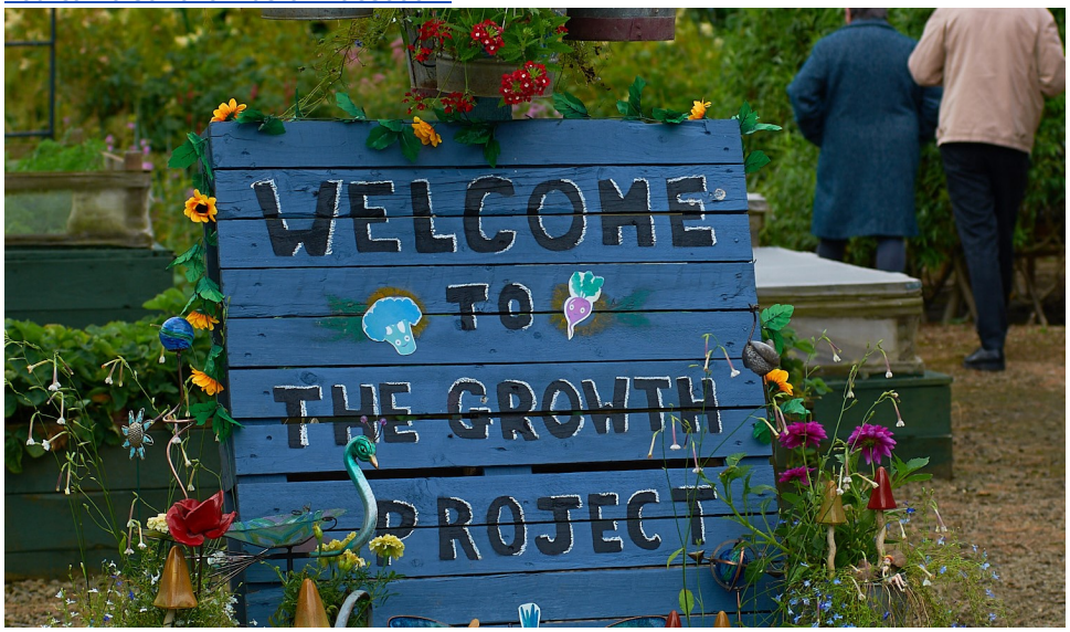
Your questions answered