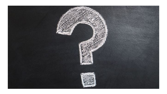
Why is the Ready for marking process important? Why do we ask you for word counts on your assessments?