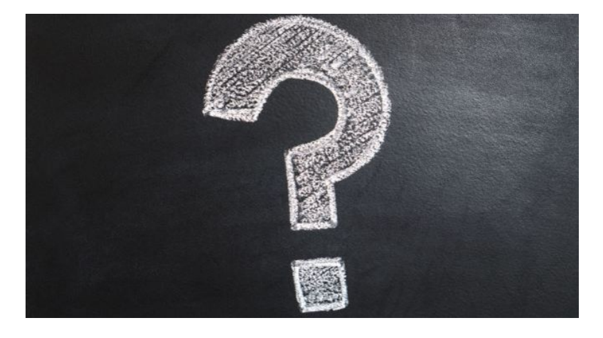
Why is the Ready for marking process important? Why do we ask you for word counts on your assessments?