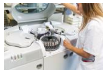
Access to Science

If you require further help or advice as to the right option for you then email our Student Services Department at studentservices@distancelearningcentre.com