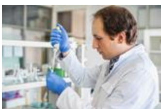
Access to Biomedical Science

These options are now available on the following Access to HE Diploma Career paths:-