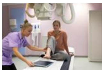
Access to Health Professions (Science)