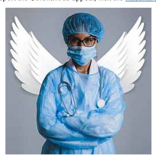
Reviews and Our Hall of Fame

If you want to donate and support the Coronavirus appeal, visit the National Emergencies Trust.